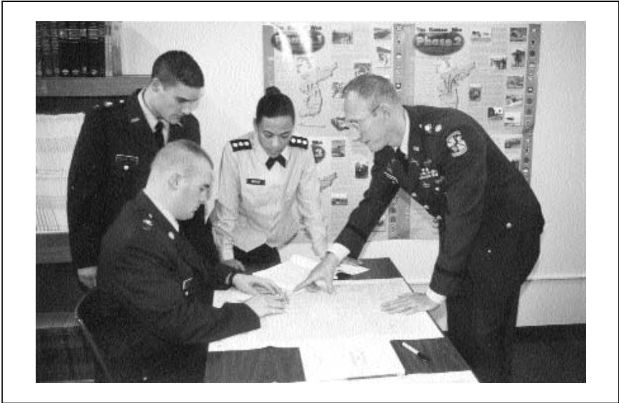
Leadership training. . . A smart career move. . . Scholarships. . . All are great reasons to consider the new ROTC program at Okaloosa-Walton Community College. The Reserve Officers' Training Corps at OWCC provides an outstanding opportunity for high school graduates who have participated in ROTC to attend college and to continue their military leadership training. Students may also begin ROTC leadership training at the college level.