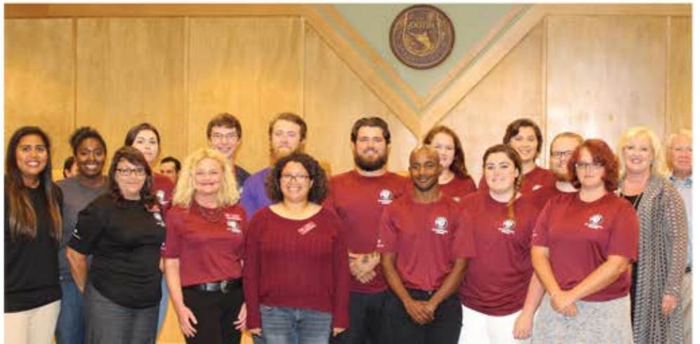
Pictured: 2017 AmeriCorps NWF Environmental Stewards team receives a Mayor's Proclamation.