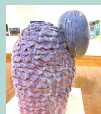
Thomas Stollar, Form 2 Ceramic Sculpture 3rd Place