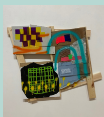
Zach Zecha, All Things Popsicles and Stuff 2nd Place