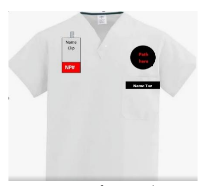
Figure 1.1 Uniform Scrub Top